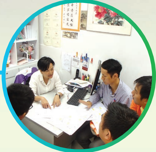
▲ 定期與黃大仙區議員和市民會面，解釋工程範圍 Regular meetings are held with Wong Tai Sin District Council members and public to explain the scope of works

此外，由於施工位置貼近民居、學校、商業樓宇和工業大廈，故在前期和施工期間，與各方保持緊密協調及溝通，屬工程團隊的重要工作之一。工程人員需要主動與區議員、鄰近商舖、工業和住宅大廈的管業處，以及市民進行定期會面和溝通，向他們詳細解釋工程範圍和各項細節，細心聆聽各持份者的意見，並適時匯報施工進度和時間表，以增進各方的相互了解，從而減少工程期間帶來的不便。