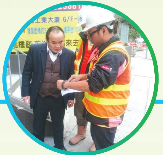
▲ 與附近的大廈管業處緊密溝通，解釋工程進度 Close communication on works progress is maintained with the building management offices in the neighbourhood