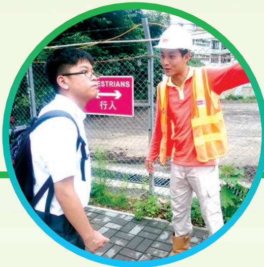
▲ 安排交通愛心大使協助途經工地附近的行人 Ambassadors are deployed near the construction sites to offer assistance