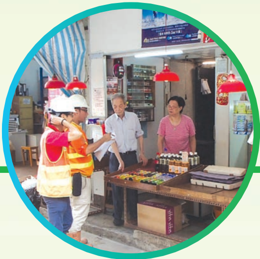
▲ 定期主動探訪區內商戶，匯報工程進展和聆聽意見 Regular visits are conducted to nearby shops to report to shopkeepers the latest works progress and collect their views

As the construction sites were in close proximity to nearby residences, schools, commercial and industrial buildings, seamless communications and coordination with all concerned parties became one of the major tasks of the project teams during both the advance works and construction phases. Project staff had taken the initiative to meet and discuss regularly with the District Council members, management offices of nearby commercial, industrial and residential buildings as well as the public to keep them abreast of the scope of works and related details, collect views from stakeholders, and report regularly the works progress and schedule to enhance mutual understanding, in order to minimise the inconveniences caused during construction.